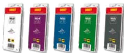
Start SG gliders