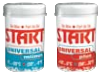
Universal kick waxes