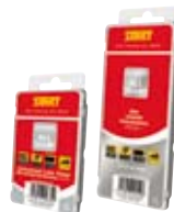
Start Universal gliders